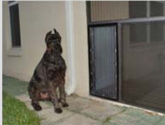
PORCHES & LANAIS