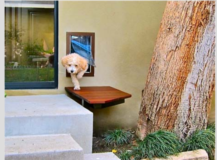
MaxSeal® Wall Mount Models