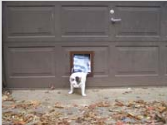
OVER HEAD GARAGE DOORS