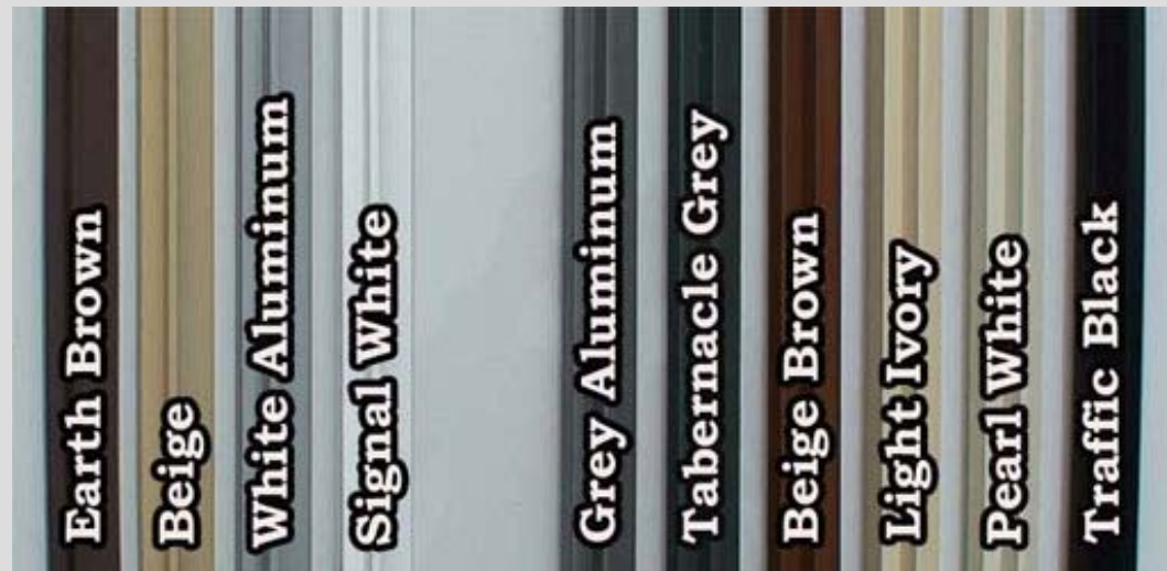
10 Frame color choices

Note: smaller pets have no problem using even the largest models for customers with multiple pets.